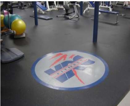
Custom logo cutting available